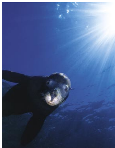
California Sealion pup