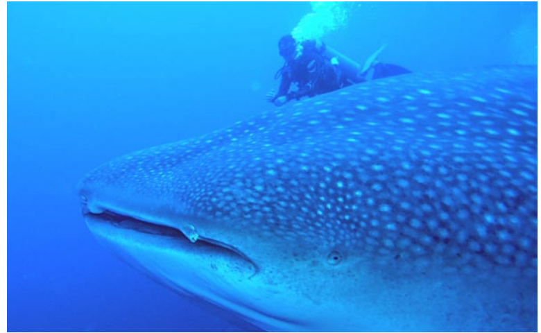
Whale Shark and diver (Cortez Club)

or diving with Whale Sharks will be offered when and if any of these wonderful creatures are located.