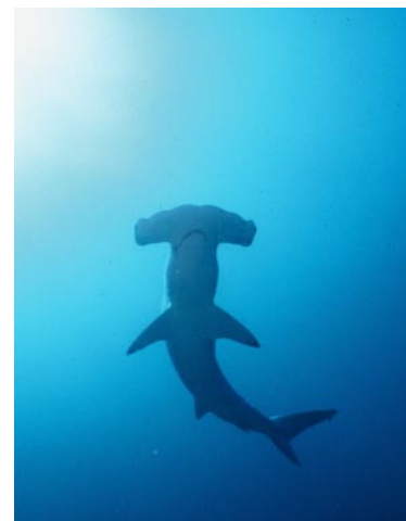
Scalloped Hammerhead (Cortez Club)

“One of the primary focuses of this trip is to spend several days diving with the famously friendly California Sealions in the waters around Los Islotes off La Paz. Our trip is planned to coincide with the young sealions making their first unsupervised dives, catching them at their most curious, cute and mischievous. Over 350 sealions of all ages live here and they are used to divers. They love to demonstrate their in-water superiority and tend to hang around for extended encounters!”