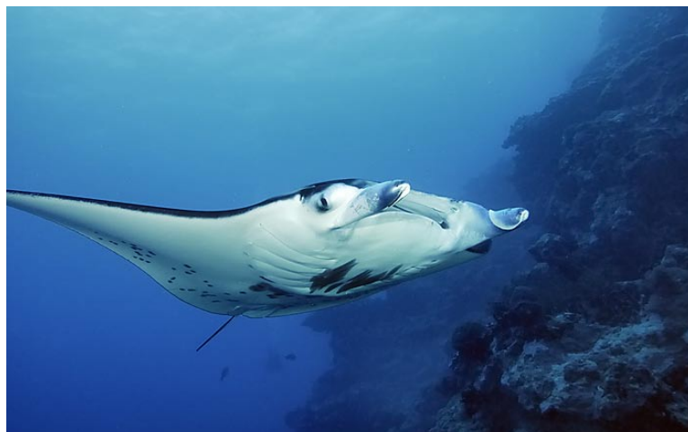
Manta Ray (Cortez Club)