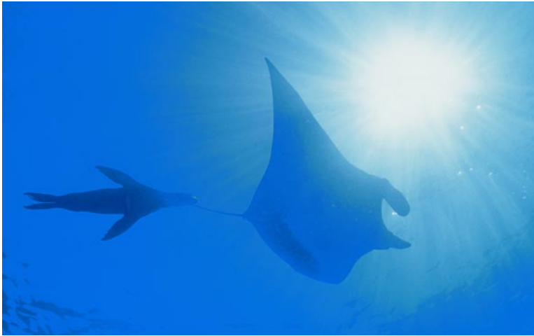
California Sealion playing with Manta Ray (Cortez Club)