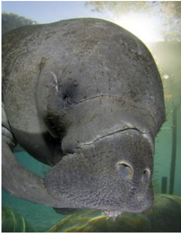
Is this a Mermaid?