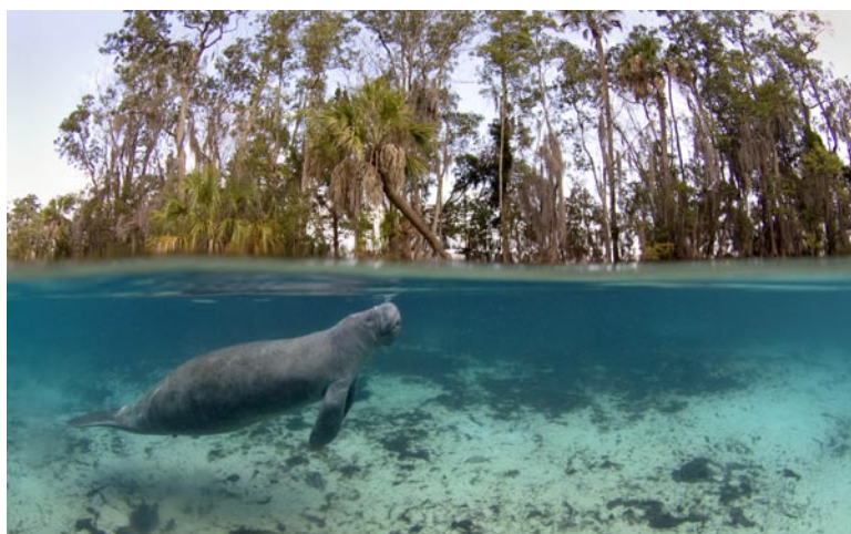
Crystal River, above and below