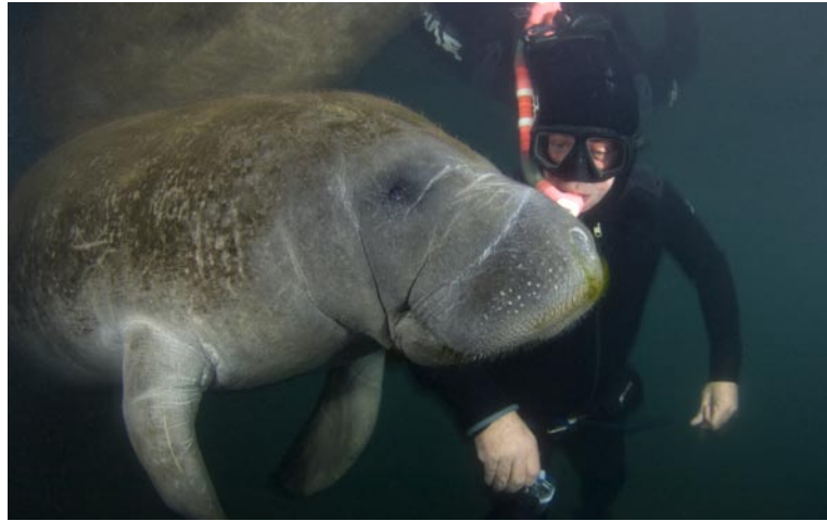
Up close and personal (Alex Mustard)