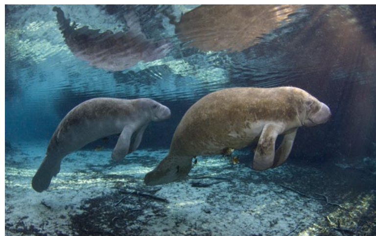
West Indian Manatees hang in the clear water

portfolio with some underwater images. Underwater housing rental for your DSLR can be arranged (with prior notice) in Florida.