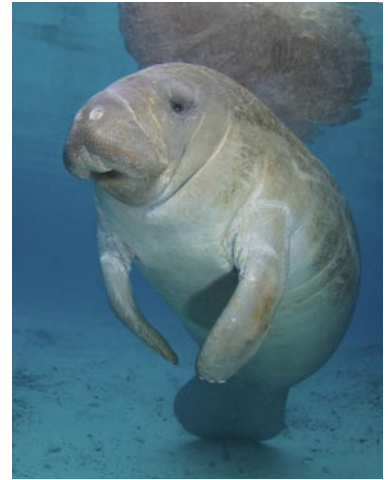
Young manatee (Alex Mustard)

“There is no need for stealth. The manatees will seek you out. Life for a manatee is an itchy business, and there is nothing the young and old seem to like more than a good old scratch. In Crystal River they know just where to get one: from you! The youngsters, hyperactive in slow moving manatee terms, supercharged on mother’s rich milk, are usually the most playful and keenest on a good scratch. They will swim right up to you, turn on their side or back and rub their flippers on their bellies, leaving you in little doubt as to what is required. Give a manatee a good scratch and it may bond with you all morning, returning to you again and again for some attention.”