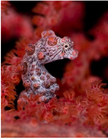
Bargibanti Pygmy Seahorse