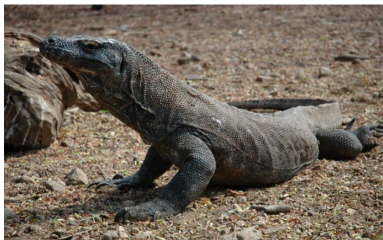
Komodo Dragon, the world's largest lizard

will be colder. We will dive both, but will probably favour the cooler, lower visibility sites, for their richness. It is important to bring wetsuits/skins appropriate for the range of conditions we will encounter.