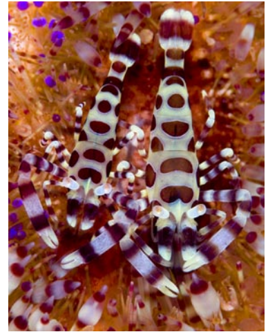
Commensal shrimps on sea urchin (Alex Mustard)

“Profusion defines Komodo’s marine life. The reefs explode with fish and invertebrates, and every available surface is plastered with life and colour. Two hundred and fifty species of coral, and more than a thousand species of fish are found here. The area is also excellent for ‘critters’; favourites such as pygmy seahorses and frogfish are common, it is a prime location for nudibranchs, and even rarities like Rhinopias are seen on most trips. Famous dive sites such as Horseshoe Bay and Cannibal Rock are discussed with due reverence by well-traveled divers. Alex’s friend, Peter Scoones, told him that he recently had the best dive of his long career here.”