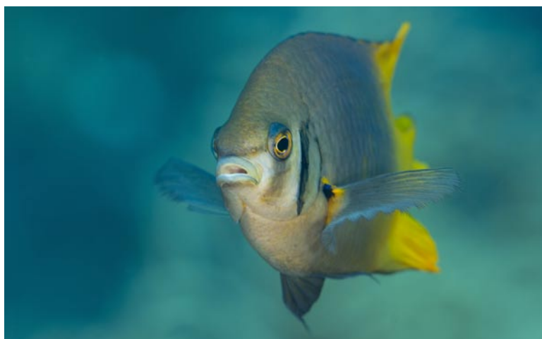
Yellowtail Damsel